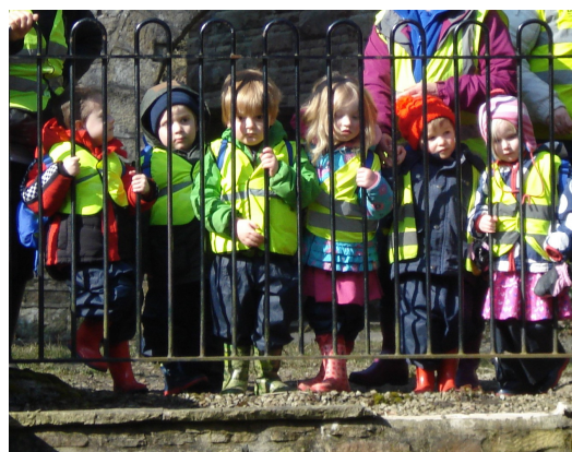
FUTURE THNM DIRECTORS?